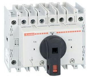
Assembled changeover switch